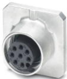
Sensor/actuator flush-type connector, 8-pos. socket, M12, A-coded, front/square flange mounting, wave soldering

Please be informed that the data shown in this PDF Document is generated from our Online Catalog. Please find the complete data in the user's documentation. Our General Terms of Use for Downloads are valid ( http://phoenixcontact.com/download )