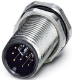
Sensor/actuator flush-type plug, 12-pos., M12, rear/screw mounting with M12 thread, with straight solder connection and key surfaces

Please be informed that the data shown in this PDF Document is generated from our Online Catalog. Please find the complete data in the user's documentation. Our General Terms of Use for Downloads are valid ( http://download.phoenixcontact.com )