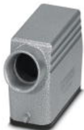
HEAVYCON sleeve housing D15, for single locking latch, height 53 mm, with support 1x M20, lateral conductor exit

Please be informed that the data shown in this PDF Document is generated from our Online Catalog. Please find the complete data in the user's documentation. Our General Terms of Use for Downloads are valid ( http://phoenixcontact.com/download )